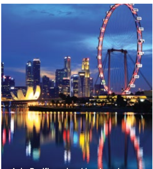
Asia-Pacific regional headquarters located in Singapore