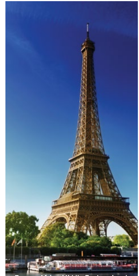
Europe-Africa-Middle East regional headquarters are located near Paris, France

Chevron Oronite is not only a unique place to work within Chevron Corporation but also offers opportunities to work at various international locations.